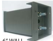
6" WALL MOUNT