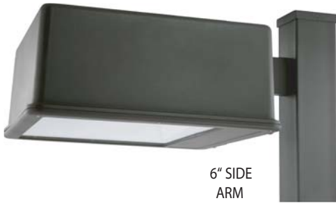
6" SIDE ARM