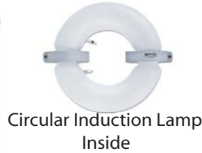
Circular Induction Lamp Inside